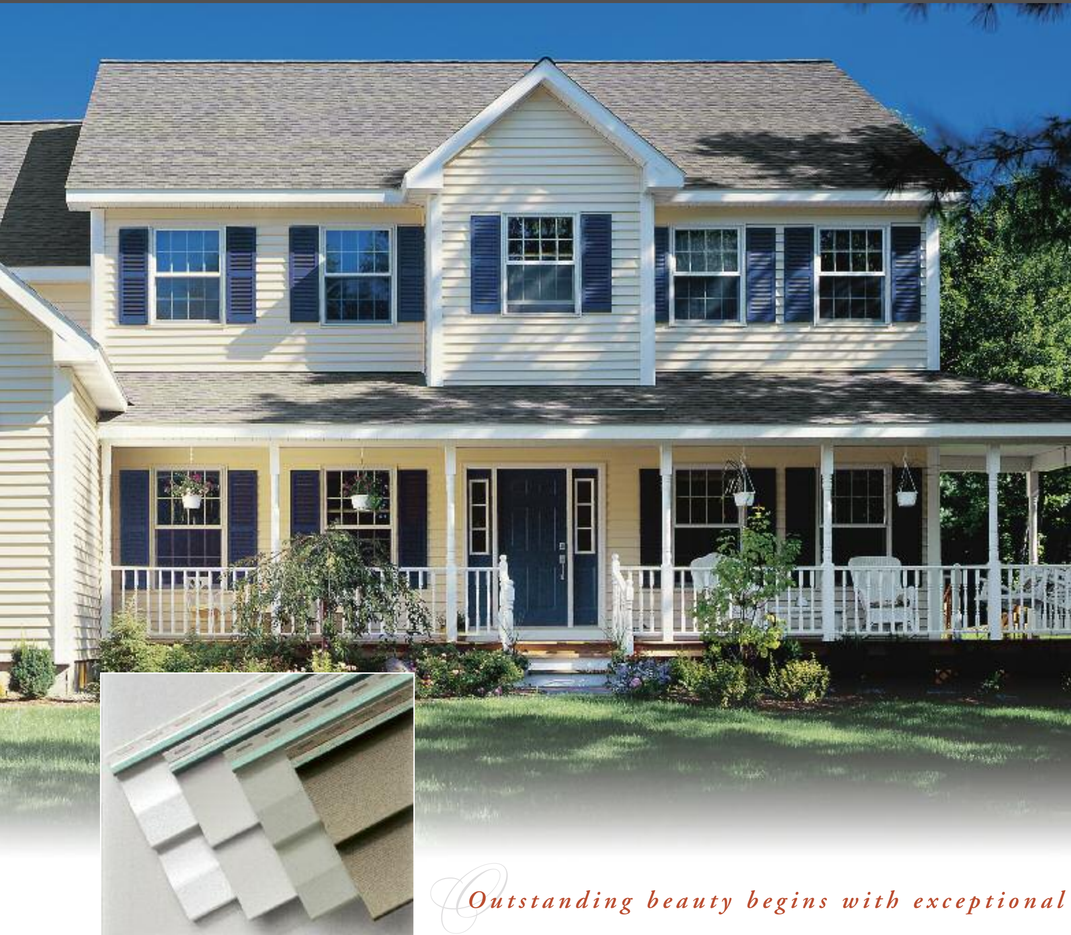
Charter Oak Siding shown in Adobe Cream (left).