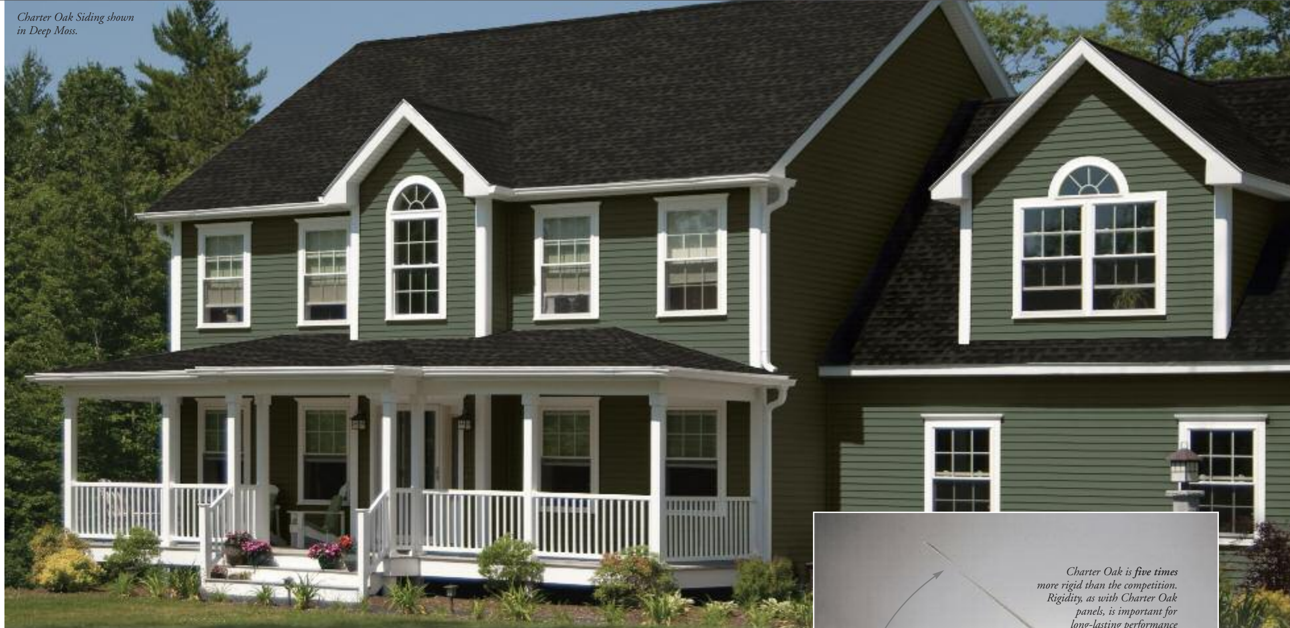
Charter Oak Siding shown in Deep Moss.

The TriBeam illustration above shows another feature that's especially important if you live in an area where high winds are common. It's a rolled-edge nail hem that gives Charter Oak its superior ability to resist the force of extreme winds. To define extreme, we put Charter Oak to another test. The result: Charter Oak stayed nailed in place in winds reaching the intensity of Category 5 hurricane winds, the designation used by the National Hurricane Center to identify the most destructive storms.