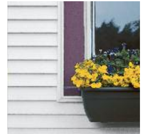
Trimworks custom crown molding used with wood window trim.