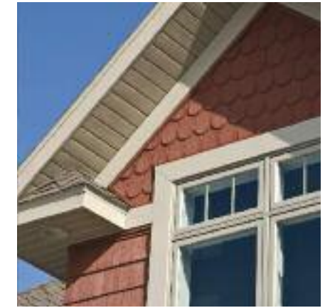
Alside Premium Scallops – Victorian inspired half-round shingles.