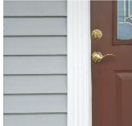
5" Trimworks fluted lineals complement this beautiful decorative door (below).