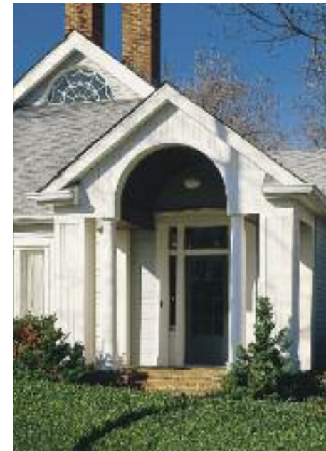
Contrast provides another way to call attention to key architectural elements. An artful contrast of vertical and horizontal siding creates an almost cathedral-like impression at the home's main entry way (above).