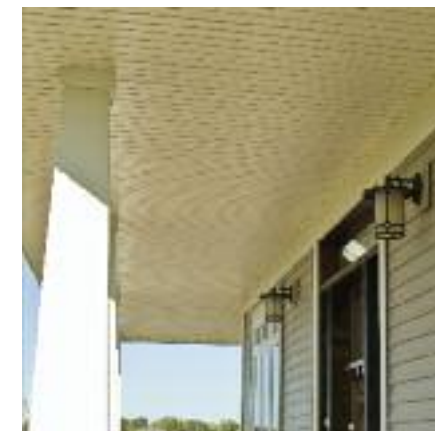
Charter Oak invisibly-vented soffit.