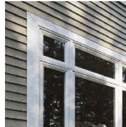
Charter Oak clapboard with Trimworks 5" window trim.