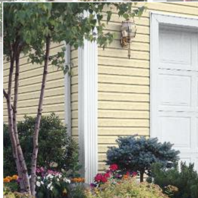
Trimworks® 7" fluted corner post. Charter Oak Siding shown in Cape Cod Gray (top of page).