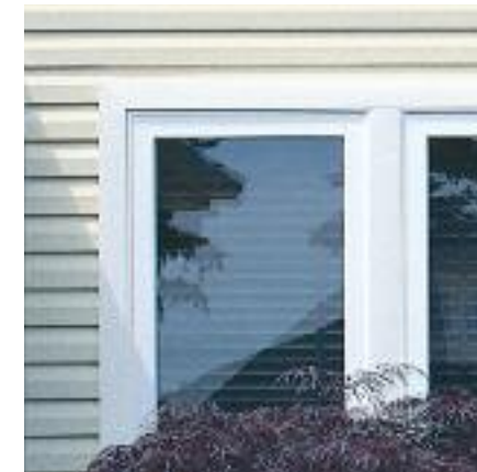
Charter Oak dutch lap with Trimworks 3 1/2" window trim.