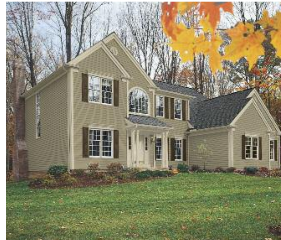
Subtle contrast. Tuscan Clay siding, Monterey Sand trim and door, Brown shutters.

ChromaTrue ® ChromaTrue helps make Charter Oak better with ASA weatherable polymers which provide superior fade resistance and better performance on darker colors.