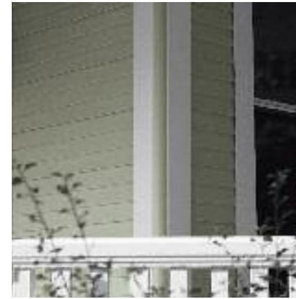
Trimworks Three-piece beaded corner post.

Alside offers a wide selection of trim and accent products made to complement the beauty and colors of Charter Oak siding.