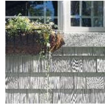
Alside Premium Shakes – the classic look of deep-grained cedar shakes.