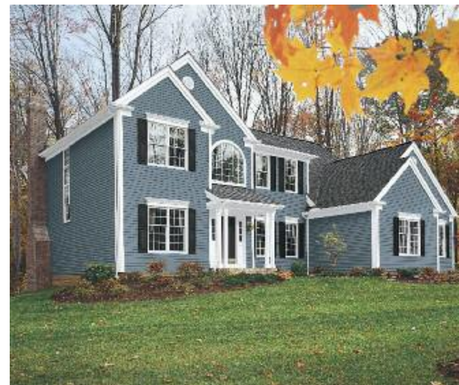
Dramatic contrast. Harbor Blue siding, Glacier White trim, Black shutters and door.

Happy with your home's exterior? Or maybe you want a new look, with different colors, more details, greater contrast.